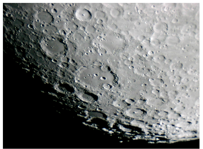
Figure 2. First Steps Into Video Astronomy: Even my early attempts with video showed the potential for this new area of amateur astronomy. The image here is a single raw video frame taken with my modified net-cam & 8" SCT.

Around the same time I was researching astrophotography I learned that numerous amateur astronomers were having good success recording images of planets using a common inexpensive webcam. The idea is to collect hundreds or even thousands of video frames and then let image processing software sort and "stack" the images. As I dug deeper I found a whole community of amateur astronomers dedicated to using video cameras for not only imaging but live observing as well. The results I saw other people achieving encouraged me to start playing with video astronomy myself. I began using an older model low light level net-cam that we had purchased as a "nanny-cam". I modified the camera to allow it to be installed prime focus on my telescope, as if it were an eyepiece. Adapters are readily available online to convert all natures of webcam for prime focus use. The first night I tried my home built contraption I was pleasantly surprised by the results. I was able to get nice sharp live video of the Moon and planets. and with very little effort. One benefit of video astronomy that immediately jumped out at me was that I could easily share what I was looking at with my wife and kids. How easy it was to simply point to the screen and discuss what it was we were looking at. I knew then that I was really onto something.