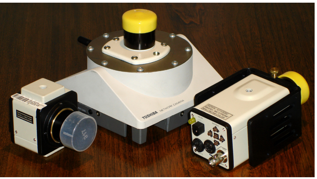
Figure 4. Author's Astro-Video Cameras: The author owns three cameras for video astronomy (from left): Mallincam Junior, Toshiba IK-WB11A net-cam, and Mallincam Xtreme.

The last thing you need to get started is curiosity and a willingness to try something new. There are so many different possible combinations of video camera, telescope, observing object, and environmental conditions, there can be no single recipe for how best to observe with a video camera. Luckily the video astronomy community is very open and friendly, and the asking of newbie questions is encouraged. It will be up to you to start from the advice of other users and explore, experiment, and hopefully enjoy.