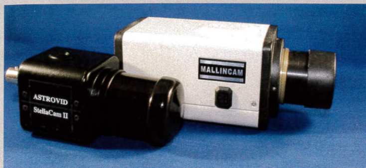
Above: Astrovideo cameras are very compact, often smaller than a wide-field eyepiece. Popular models shown above or those available from Orion Telescopes & Binoculars come with a 1¼-inch nosepiece to fit directly in your telescope's focuser.