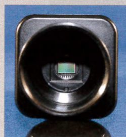
Video camera detectors are by their very nature small due to the format of analog television. Although this makes placing your target on the detector difficult, the tiny field of view is too narrow to reveal any off-axis distortion inherent in most telescope optical designs.

allowed them to capture deep-sky objects.