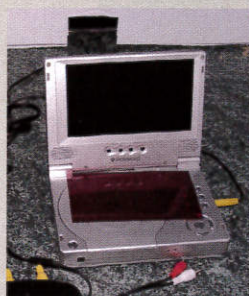
Left: Besides the camera, you'll need a video monitor to display your exposures as they come off of the camera. When in remote locations, the author uses a small, portable DVD player that includes a video input. The player's internal battery is adequate for displaying images throughout an entire evening.