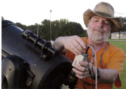
Left: Setting up an astrovideo camera couldn't be easier — simply replace your eyepiece with your astrovideo camera. Your telescope then becomes the camera's lens.

observing site. If you are working from home with AC power available, you can use any TV/monitor with a standard composite video input. At a remote location, you'll usually need one that runs on DC. I use one of the ubiquitous portable DVD players, one with an input jack for external video that allows me to use it as a monitor. The screen is small, but it looks good and runs a long time on the internal battery.