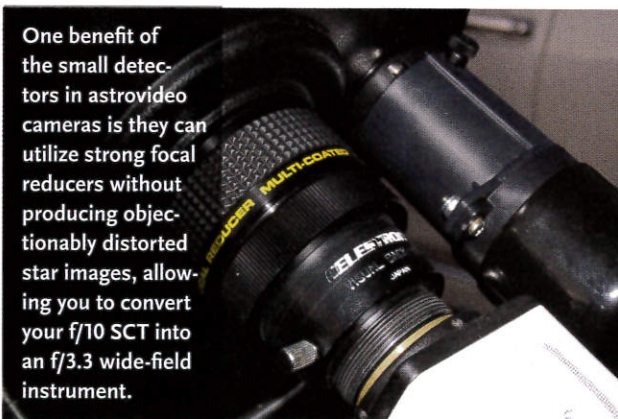
One benefit of the small detectors in astrovideo cameras is they can utilize strong focal reducers without producing objectionably distorted star images, allowing you to convert your f/10 SCT into an f/3.3 wide-field instrument.

On first-light night for the Xtreme, Orion was hanging in the sky, so I naturally slewed the 11-inch SCT to the Horsehead, set the exposure to 56 seconds, and let fly. What was displayed when the first image came in made my jaw drop! IC434, the "background," was bright red. The reflection nebula to the northeast, NGC 2023, was icy blue. But what most impressed me was the dark nebula itself.